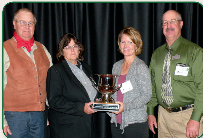
Conservation District of the Year: Branson-Trinchera CD