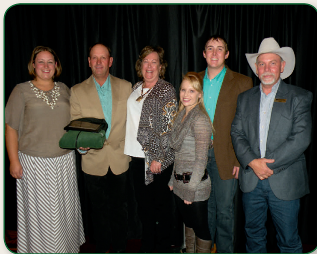
Farmer of the Year: Nissen Farms LLC, Mosca – Hooper CD