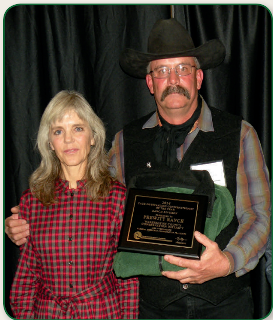
Rancher of the Year: Prewitt Ranch – Washington County CD

During this year's Resource Committee hearings, there were four Resolutions that made it onto the Consent Calendar, nine Resolutions that were passed in Committee with amendments, and one Resolution that came forth in Committee. All of the Resolutions that came out of the RC's were