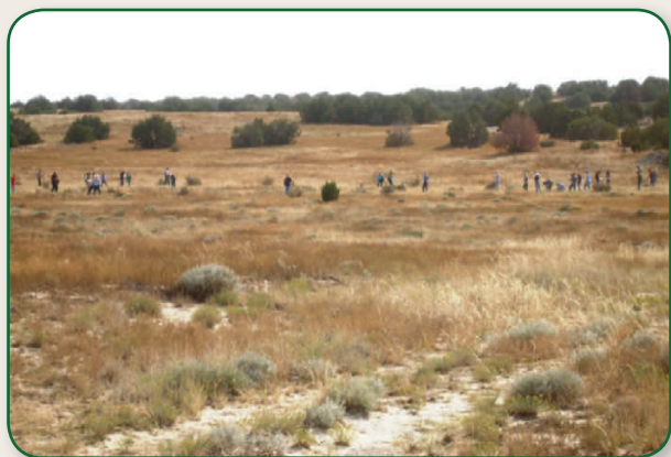
This image shows one group of students judging an Alkaline Plains site, one of two ecological sites located south of La Junta. The participating teams were Hoehne, Kim, Fowler, Prichett, Lone Star, Rocky Ford, Burlington, Arickaree, Stratton, Merino, Idalia, Peetz, and Branson.

Future Farmers of America (FFA) students and their advisors from high schools across eastern Colorado arrived at Otero Junior College in La Junta on October 8, 2014. The purpose was to compete in a rangeland plant identification exercise and participate in judging the soundness of rangelands. This state-level competition attracted 98 students, representing 13 FFA Chapters, from as far away in Colorado as Merino & Peetz to the north and Hoehne & Branson to the south.